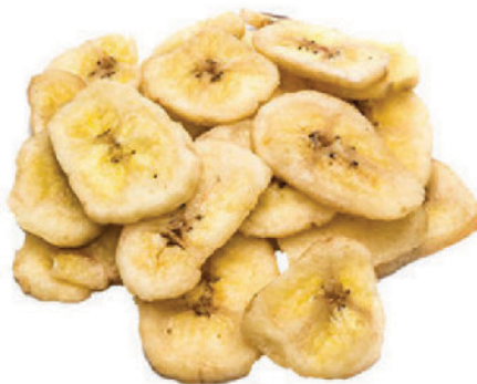
Freeze Dried Banana