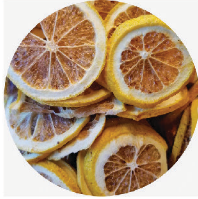
Freeze Dried Lemon