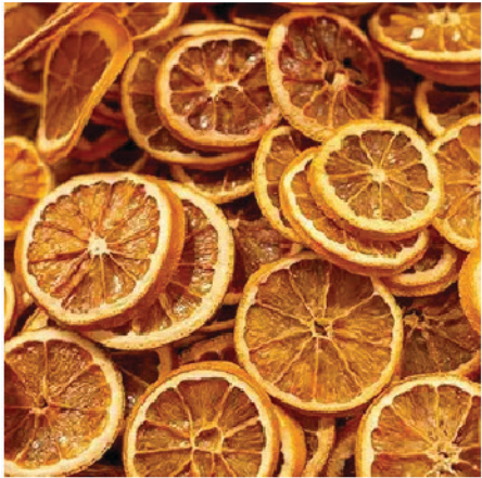
Freeze Dried Orange