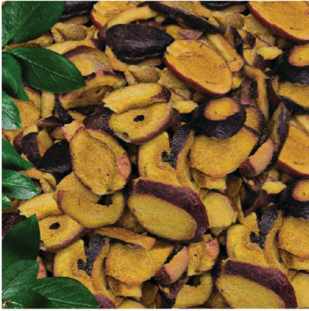
Freeze Dried Plum