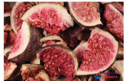
Freeze Dried Fig