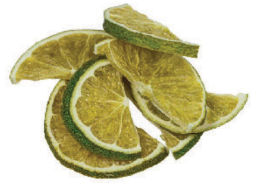
Freeze Dried Lime