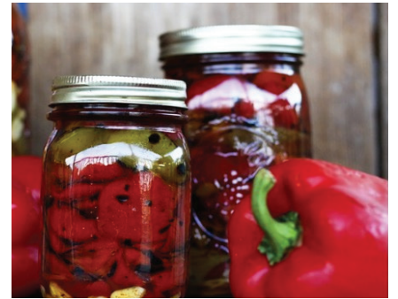
Roasted Red Pepper