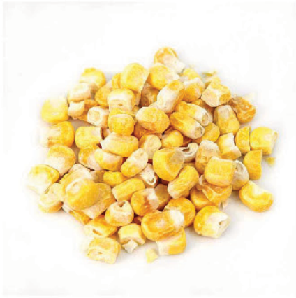
Freeze Dried Sweet Corn