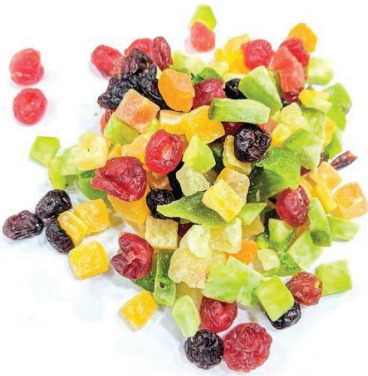
Dried Mixed Fruit