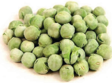
Freeze Dried Green Peas