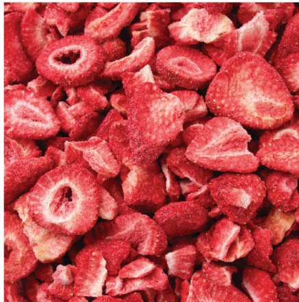
Freeze Dried Strawberry