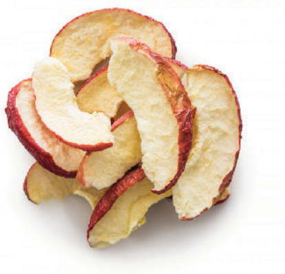
Freeze Dried Apple