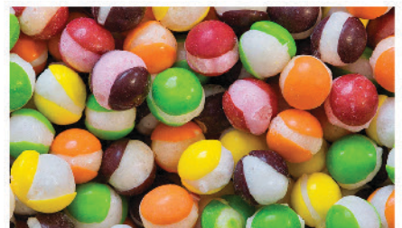
Freeze Dried Candy