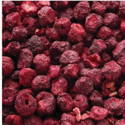
Freeze Dried Cherry