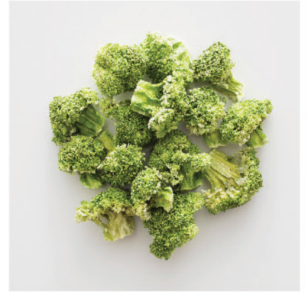
Freeze Dried Broccoli