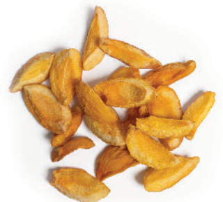
Freeze Dried Apricot