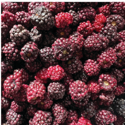
Freeze Dried Blackberry