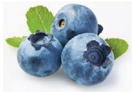
Freeze Dried Blueberry