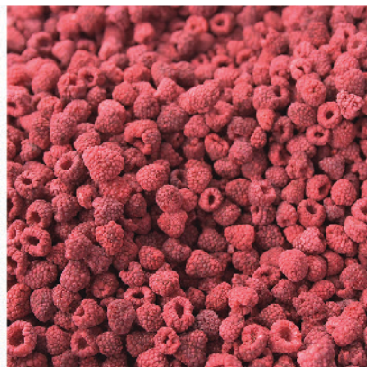
Freeze Dried Raspberry