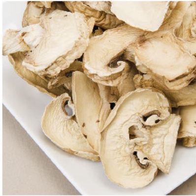
Freeze Dried Mushroom